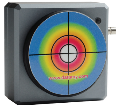
WinCamD-LCM 1.8 x 1.8 x 0.8 in 46 x 46 x 20 mm

The WinCamD-LCM is paired with DataRay's full-featured software which has no license fees, unlimited installations, and free software updates. It is ideal for applications including: CW and pulsed laser profiling; field servicing of laser systems; optical assembly; instrument alignment; beam wander and logging; R&D; OEM integration; quality control; and M^2 measurement with available M2DU stages.